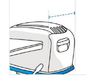
2. Depth #1: Depth #1 of the Outdoor Boat Motor

3. Depth #2:: Depth #2 of the Outdoor Boat Motor