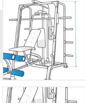
5. Total Width: Total Width of the Multi-Gym Equipment